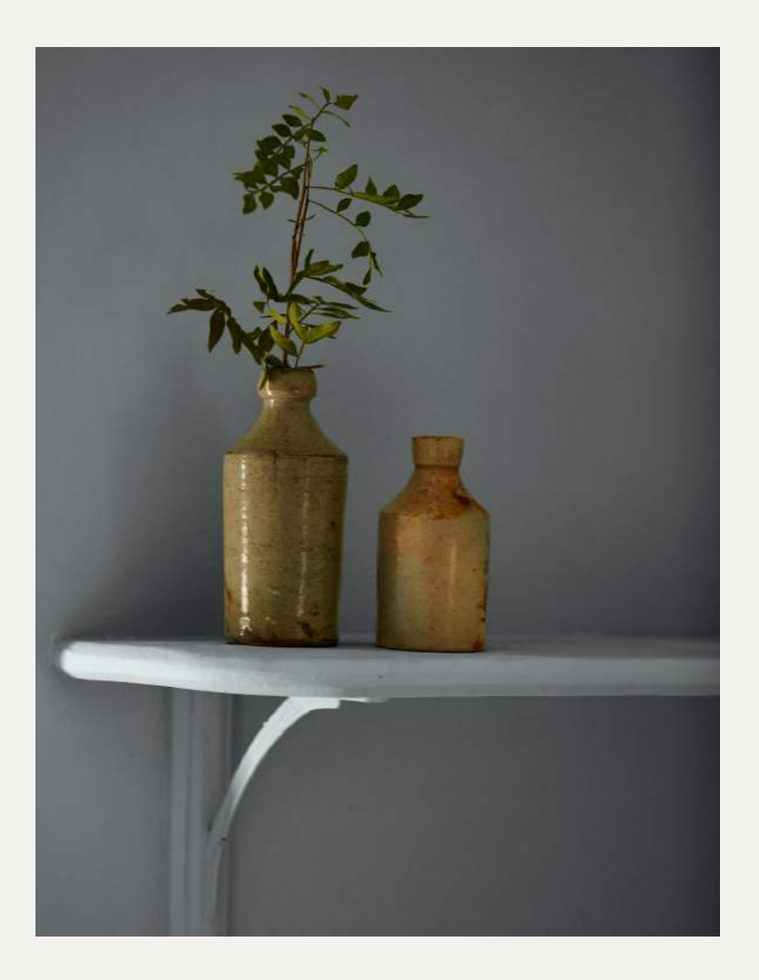
Featuring colours from original 19th-century logbooks and William Morris archive designs, the authentic Morris & Co. palette is tailor-made for every budding craftsperson. In a versatile palette of 40 timeless hues, Morris & Co. pay homage to the company's compelling artistic development, over 160 years after its creation in 1861.