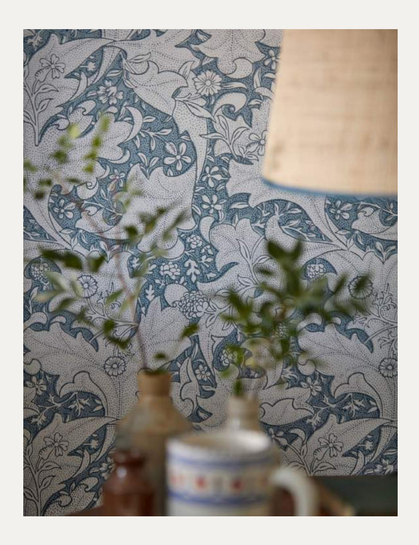
Morris & Co. are thrilled to re-introduce Wallflower, an 1890 wallpaper design created by William Morris. Scrolling acanthus leaves foreground tenderly rendered wallflowers, creating a pattern of enormous energy and vitality. Dark spots offer the surface a layer of texture, whilst the whitened foliage introduces an almost sculptural quality.